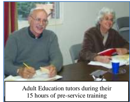
Adult Education tutors during their 15 hours of pre-service training

In 2012/13, the Literacy Council benefited from the voluntarism of 217 tutors, 10 board members, and 50 special event volunteers. These individuals are the true life of the Literacy Council, contributing to student success daily.