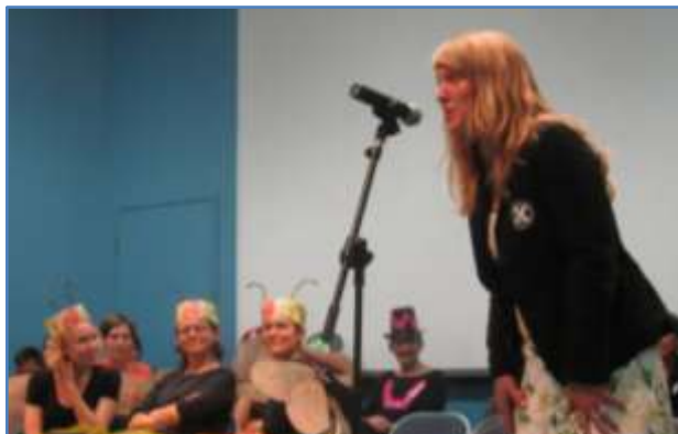
"Bring it to the Bee" Adult Spelling Bee, April 11, 2013